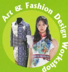
Art & Fashion Design Workshop